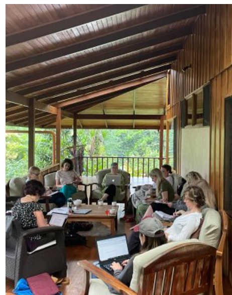
Writing group in Costa Rica

Throughout the week, we may choose to write in evocative locations around York, and on the final evening, we'll share our work with one another in a final celebration.